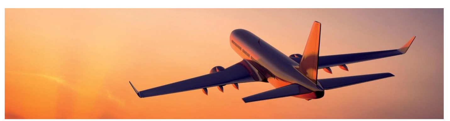
Day 9: End of Itinerary